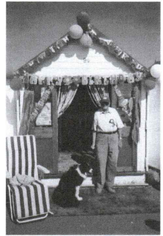
Pop enjoying a day at the family hut

We've also witnessed quite a few rescues which have taken place off our shore, including one which we conducted ourselves. We were busy mending up our nets over the seawall with our skiff on the beach nearby still rigged from when we came ashore. We heard cries for help from a hundred yards out amongst the boat moorings and straight away saw three lads in the water, two of whom were desperately trying to hold the third one up but were having great difficulty in doing so. There were three of us too, and there was no time to lose. We took hold of the skiff, dragged it down the beach on the run, and launched it "Hawaii Five-O" style towards the lads. We were alongside them in a moment and between us hauled them choking & spluttering into the skiff. Once back ashore they soon recovered, dressed and went off back to their school from which they had escaped for a lunch break. It was all over in a trice but the memory lives on. Had we not chanced to be there with a boat to hand who knows what would have happened!